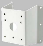
SCB2000 : Corner mount bracket