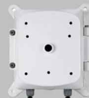
SOJ-S24-24 : AC Power Junction Box