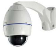
- Without Sun-Shield