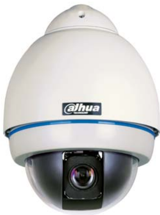
DH-SD6665-H: 26x optical zoom, 480TV lines